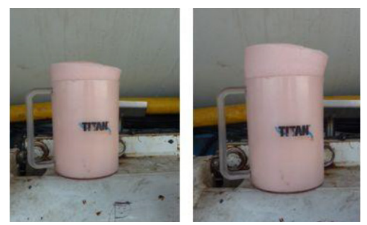
TITAN<sup>®</sup> Bulk Emulsion 1.10 gr/cc density 0.95 gr/cc density

The trained bulk emulsion delivery truck operator can program up to four different loading charges in the blast